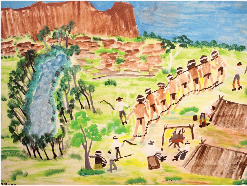
Fig. 9.10 Wundigala , Myra Rory, 2008