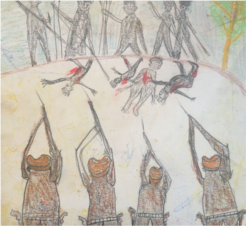
Fig. 9.4 Drawing of settler colonial violence in the Gulf Country, Dinny McDinny, (1927–2003)