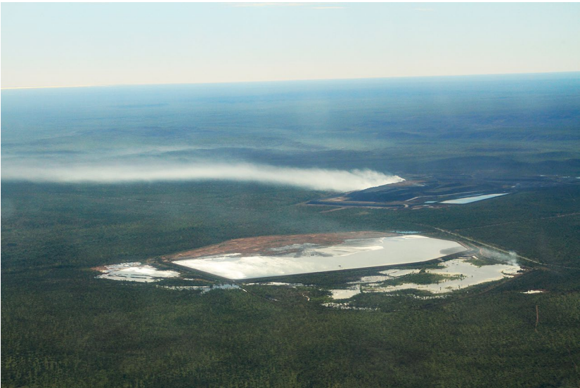
Fig. 9.3 Sulphur dioxide billowing from McArthur River Mine