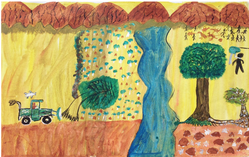
Fig. 9.9 Whitefellas work like white ants , Jacky Green, 2014

In Whitefellas work like white ants (Fig. 9.9), Green visualises the state's obsession with the individual as the death knell for Indigenous peoples.