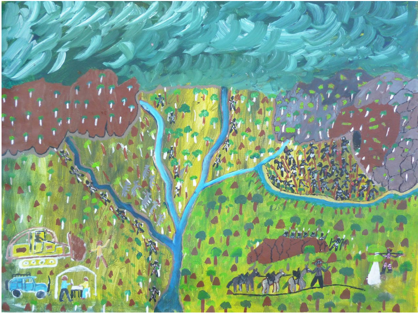
Fig. 9.5 Same story, settlers-miners , Jacky Green, 2013