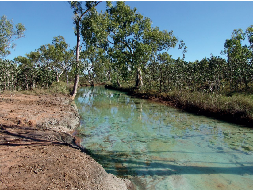
Fig. 9.2 Copper sulphide from Redbank mine flows directly into Hanrahan's Creek killing all aquatic life