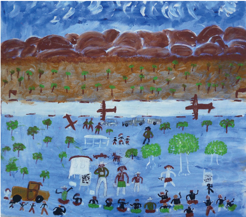
Fig. 9.8 FIFO—Fly In Fuck Off , Jacky Green, 2013

Jacky Green’s provocative painting FIFO—Fly In Fuck Off (Fig. 9.8) captures something that many of us never see, the Aboriginal experience of dealing with state officials and mining company representatives in remote regions of the continent. It gives us a rare glimpse of the power relationship from an Aboriginal viewpoint. Green’s artwork details how these meetings unfold after the planes arrive.