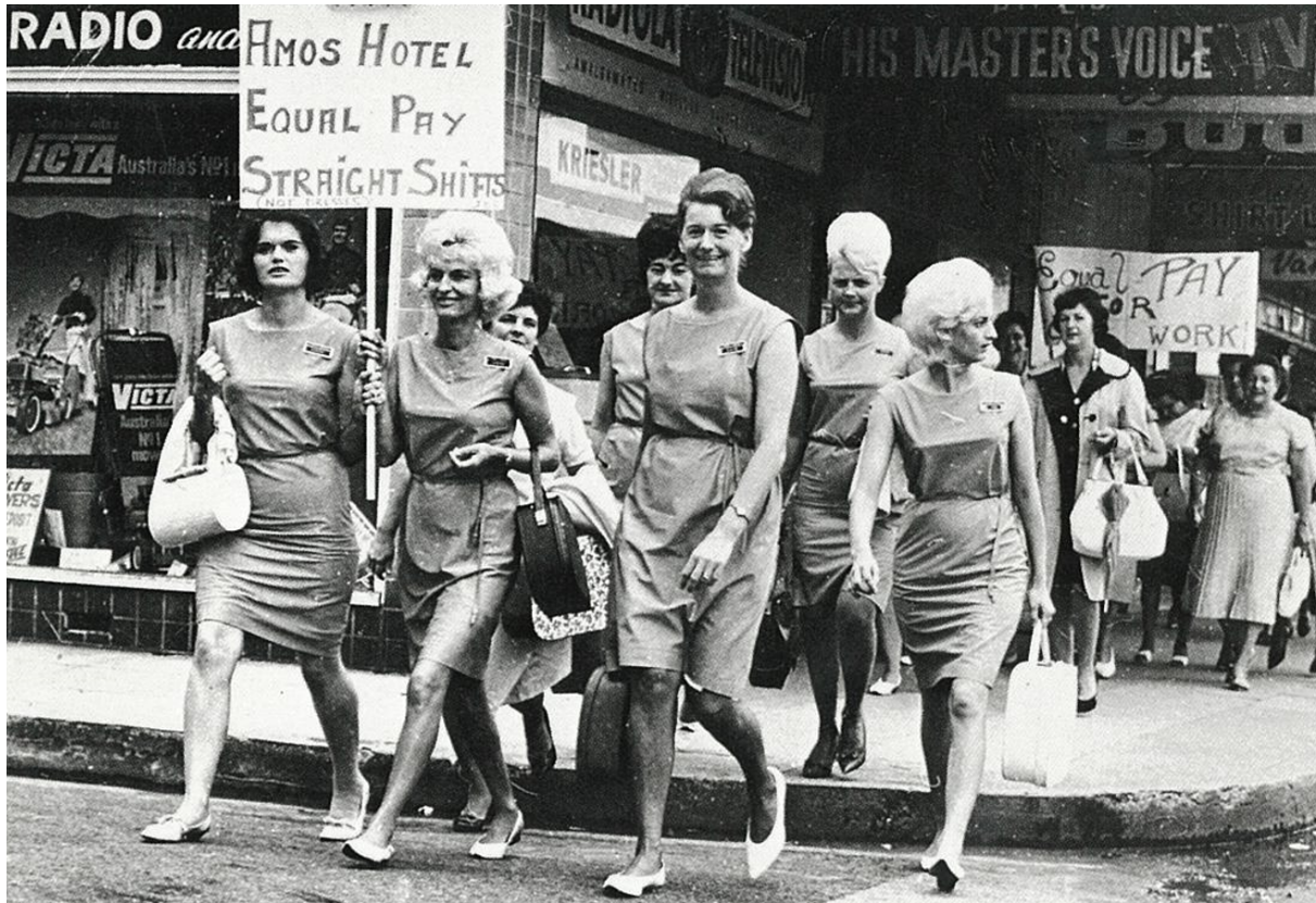
Barmaids strike for equal pay, Newcastle, 1962

A resurgent feminism is grabbing headlines, re-igniting interest in the bold, stirring, witty films, championed by the Sydney women's movement of the 1970s & 80s. Feminism & Film honours the diverse influences and intentions of women who made the films for discussion; committed to the serious undertakings; collaborated on stories of country and culture; and worked for love, but not always money.