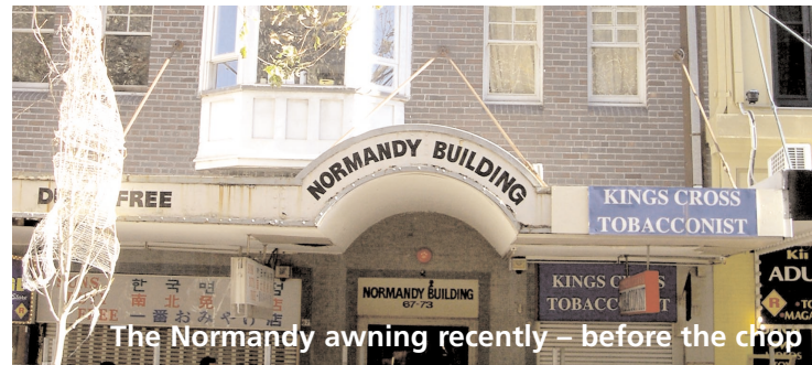
The Normandy awning recently – before the chop

Council's own Art Deco 'Woolworths' building photographed recently... and after the chop