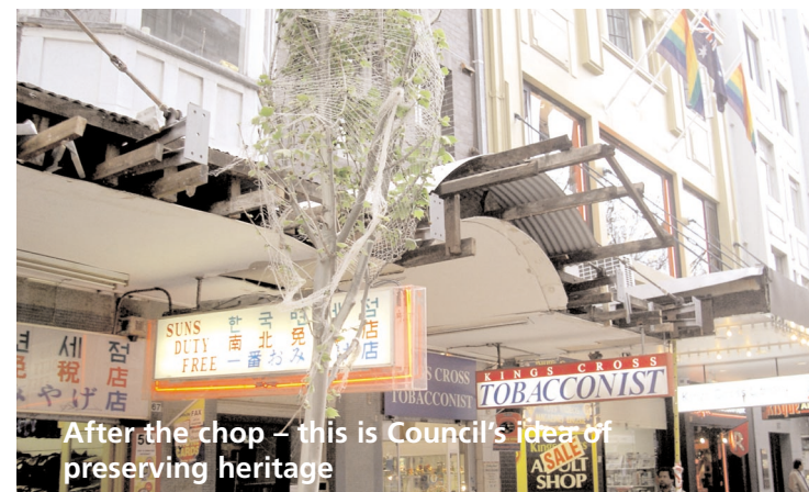
After the chop – this is Council's idea of preserving heritage