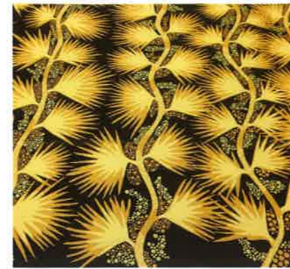
Gracie Kumbi Merrepen , 2014 Screen print on linen