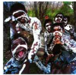
Painting up for Bunggul