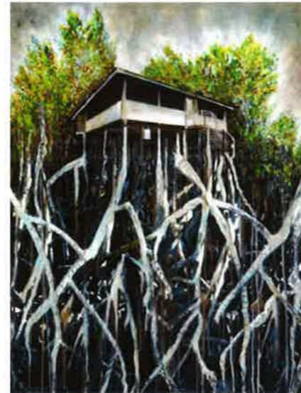
Anna Reynolds Old Stella Maris – Darwin , 2011 Digital photograph (1/10)

strong environmental sensibility. Jobling makes the paper she prints on from plant fibres. Her works in Botanica are drawn from the exhibition Mesozoic – The Age of the Cycads shown at Nomad Art in 2011. Cycads are the world's oldest living seed plants and are often seen as iconic symbols of the Top End landscape. The works here are one-off prints on papers made from plants 'pigmented with bush charcoal and phosphorescent materials, alluding to the effects of fire'. 1