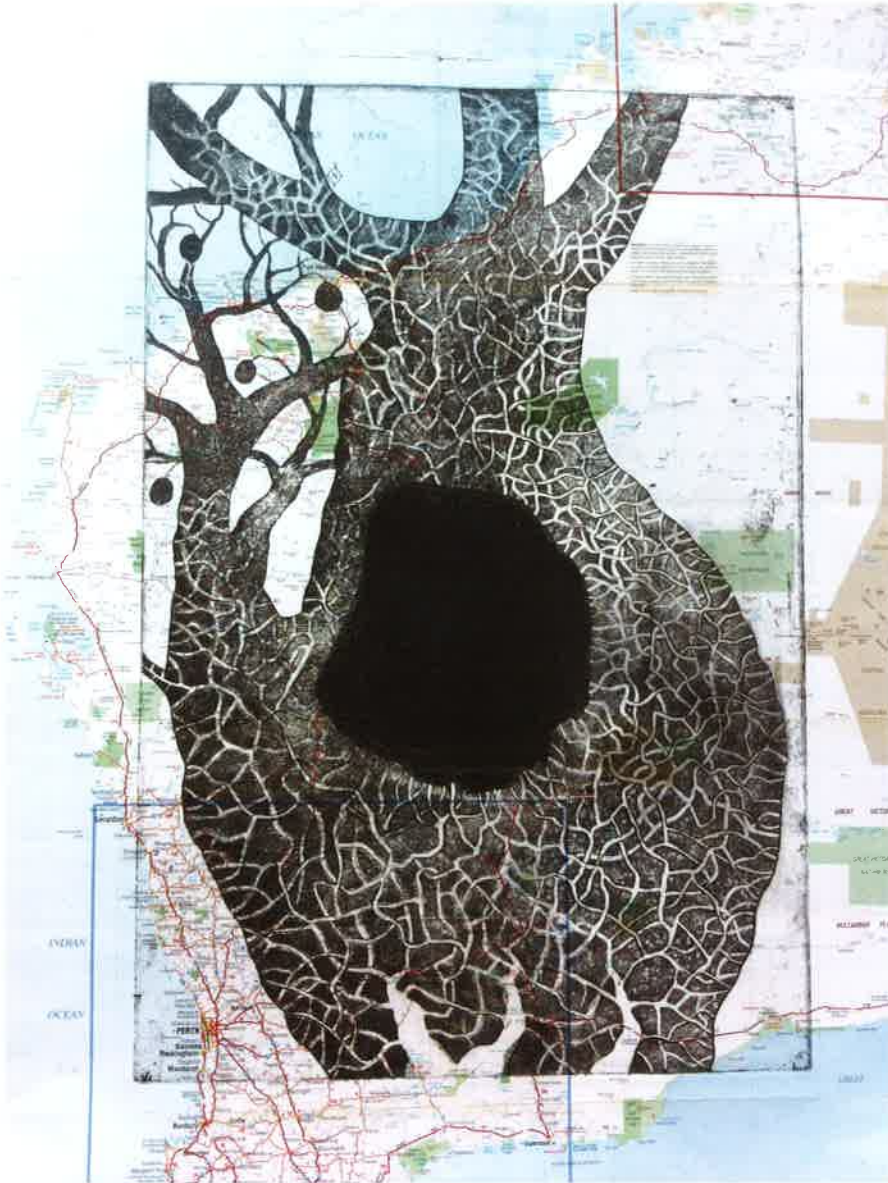
Mandy Edge Tootell · Boab , 2011 Etching and aquatint on map paper