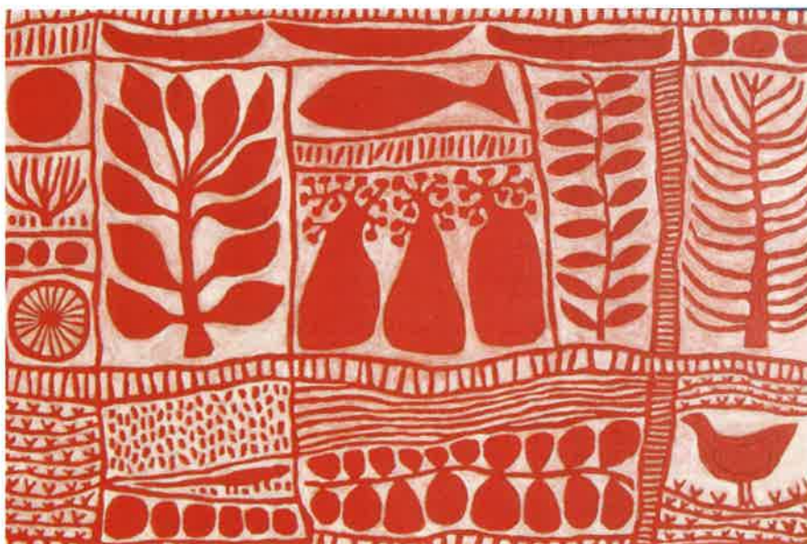
Marina Strocchi Three Boabs , 2010 Acrylic on linen

elements of the ecosystem from her country Yumpurpa in the Tanami desert – the bush potato, the pencil yam and the caterpillars that feed on them. She uses strong colour combinations and expressive brushwork to create works that vibrate with energy and power.